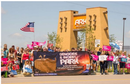
Ark Encounter Protest