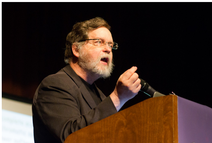
PZ Myers speaking at Skepticon 7

Of course, the "big breakthrough" was due ten or twenty years ago, and we're not significantly closer to living forever in any form than we were then. PZ Myers has made a habit of deflating our fantasies about aliens and our simple stories about evolution. Join us September 29 at the Rondo Community Outreach Library as he does the same to our dreams of eternal life.